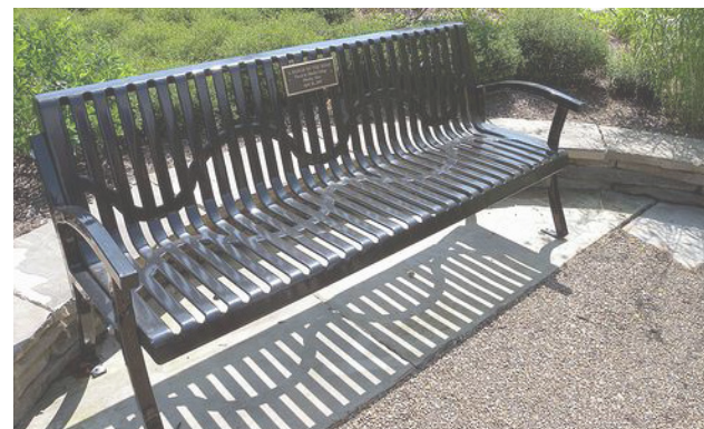
Sponsor a public bench

Another option might be to look to civic crowdfunding to fund various projects.