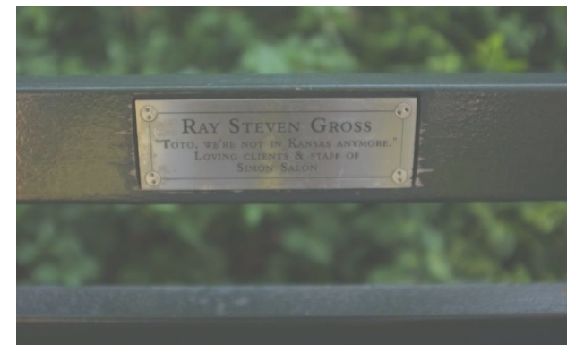
Recognition or remembrance