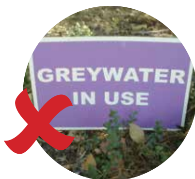
DIAGRAM 3: INCORRECT SIGNAGE WORDING