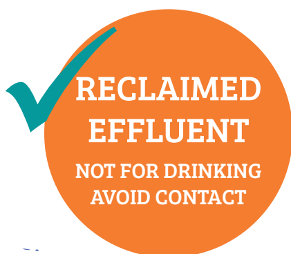
DIAGRAM 2: CORRECT SIGNAGE WORDING